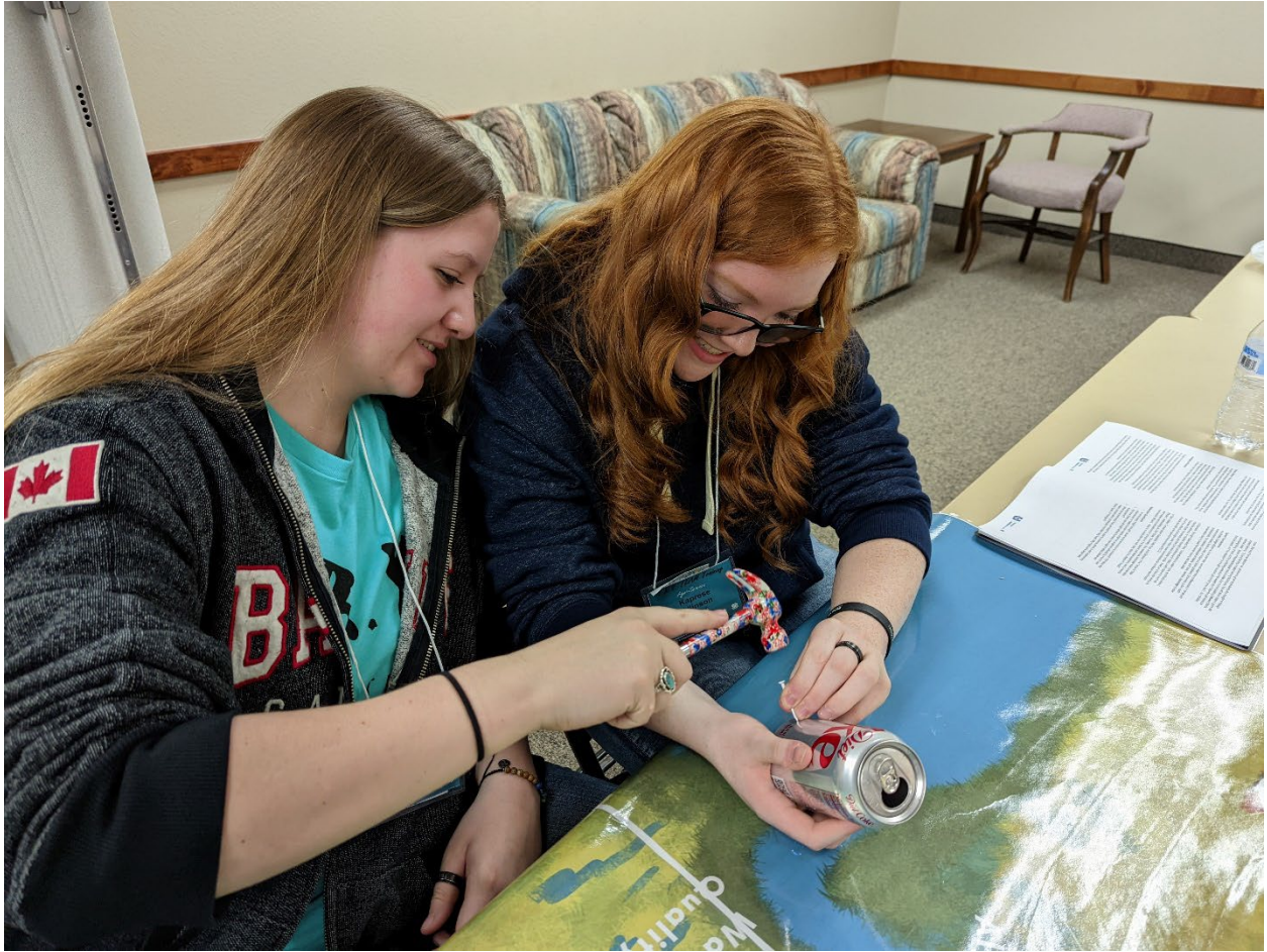
TRY team trough design