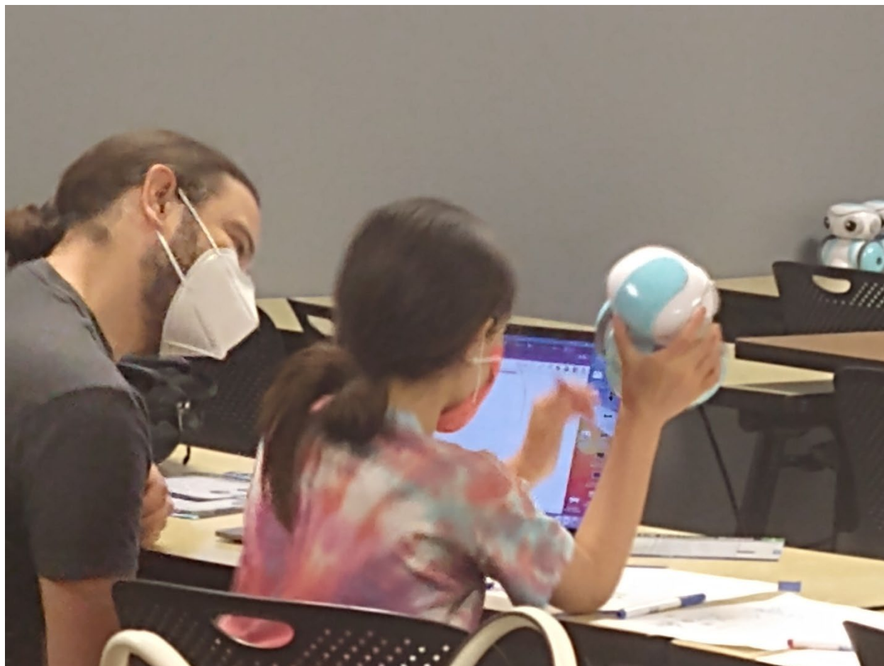
Father and daughter working on robotic arts