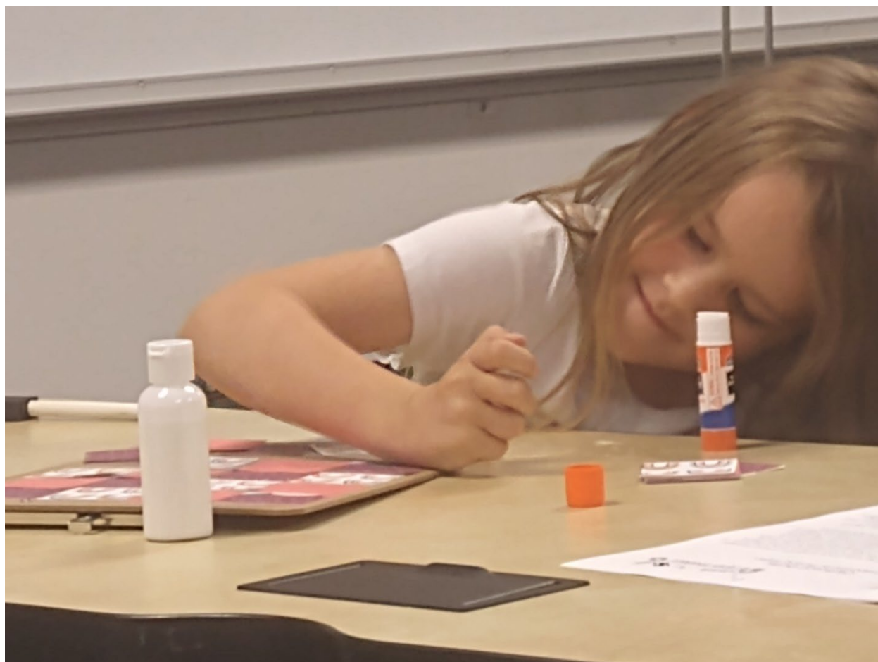
Clipboard quilts activity