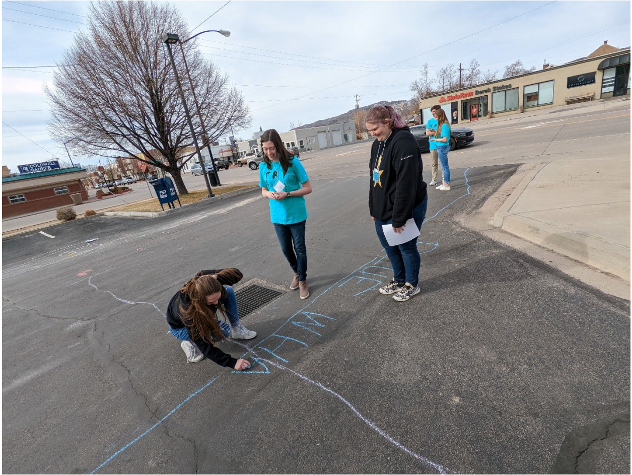
TRY team code your walk